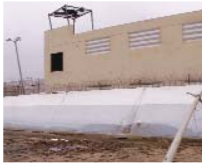
Chincha prison wall and power poles tipped.