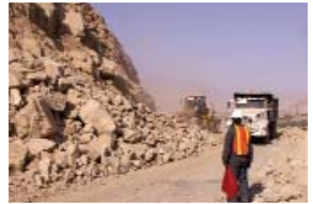
Rock fall on road east of Indenpencia.

The Pan American Highway from Lima to Pisco and Ica was closed immediately following the earthquake due to a rockslide just north of Chincha. Slides also occurred in roads leading to the Andes.