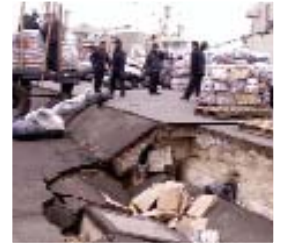
3 - 4' settlement behind sea wall.