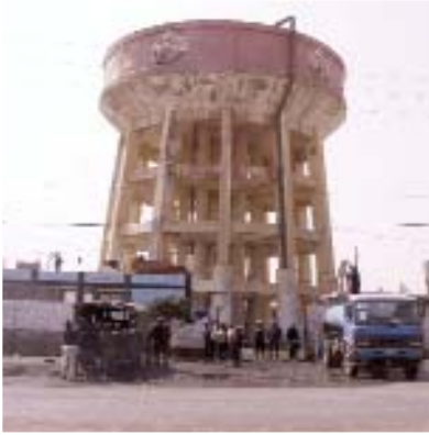
Elevated tank/emergency water distribution.

The Pisco system had one 370,000-gallon concrete elevated tank (where their operations center is located) and one 1.2-million gallon ground-level tank. The elevated tank support structure had spalling at the joints. The ground level tank appeared undamaged. Many concrete elevated tanks throughout the region appeared to be undamaged.