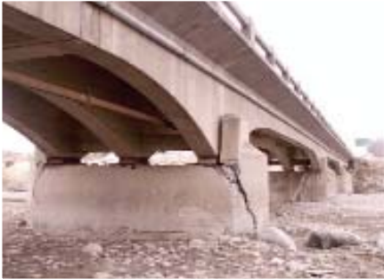
PanAm highway bridge over Rio Pisco.

Six days after the earthquake, the highway was open in one direction, but was closed again several days later. Just downstream of the bridge, a concrete panel lining the river dike/bank had slumped down the bank. Other bridges in the impact area were observed, but only very slight damage was found.