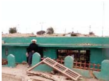
Tambo de Mora house settled four feet.