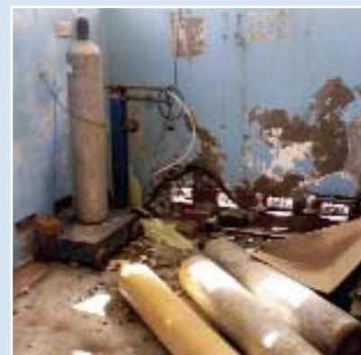
Chlorine room under elevated tank.

Bottled water was shipped in through the Port of San Martin. Much of their system is PVC piping, with only moderate amounts of CIP and AC. Evaluation of the distribution system had not taken place at the time of inspection.