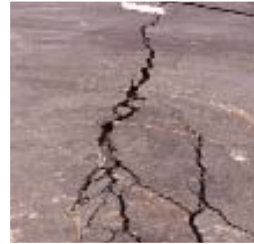
Ground cracking around pipeline/manhole.