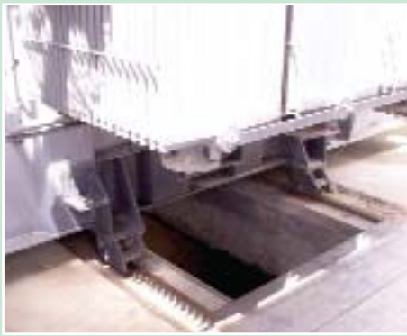
60KV transformer moved on rail breaking insulators.