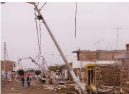
Tambo de Mora street with extensive liquefaction.

A tsunami, two to three feet in height, was reported along the coast although there was no report of catastrophic damage. Evidence of the tsunami in the form of deposited debris was observed in Paracas, Pisco and Tambo de Mora. Offices in a fish processing facility in Tambo de Mora were flooded. Adobe structures were also damaged in Tambo de Mora due to the tsunami.