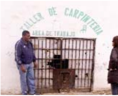
Chincha prison door/wall settled four feet.