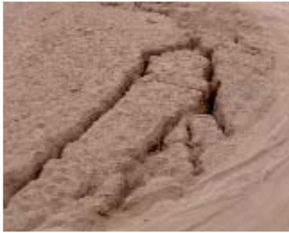
East edge of lateral spread Tambo de Mora.