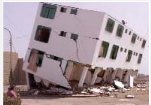
Building collapsed due to soft story.

A high percentage of housing was constructed of adobe, which performed poorly. Most of the fatalities resulted from the collapse of adobe structures. Most multistory structures, as high as five stories, consisted of a reinforced concrete frame with infill comprised of hollow tile or brick. The damage mechanism for these types of structures was that the infill falls out when subjected to out-of-plane loading. Once the infill masonry is gone, the concrete frame has little lateral load resisting strength, and collapses. Some of these structures performed well while others collapsed. The specific design and detailing influenced their performance. In several cases, soft stories (buildings with limited lateral support on the first floor) collapsed.