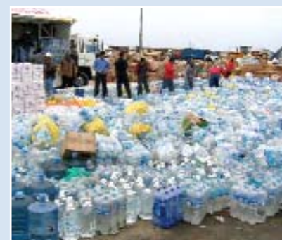
Emergency water supplies.