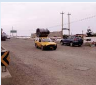
Emergency water tank delivery Tambo de Mora.

Bottled water was shipped in through the Port of San Martin. Much of their system is PVC piping, with only moderate amounts of CIP and AC. Evaluation of the distribution system had not taken place at the time of inspection.