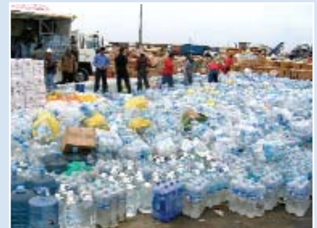
Emergency water supplies.

The front (water side) 60 feet is pile supported. Fill behind a sea wall settled about three feet, and pushed the wall towards the piles, slightly bending them. A warehouse just behind the sea wall had pile-supported walls. The floor and surrounding area settled about two feet, with extensive evidence of liquefaction. The port personnel were unloading coal and emergency supplies while the reconnaissance team was in the area.