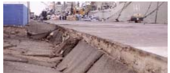
Loading emergency supplies/settlement.