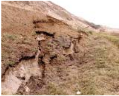
Scarp on east edge of lateral spread.

At a regional prison near Tambo de Mora, walls toppled and/or sank into the ground as much as four feet. Power poles and light poles toppled. Approximately one km east of the prison, a scarp formed along the eastern edge of a large block of soil hundreds of meters in each dimension indicating lateral movement.