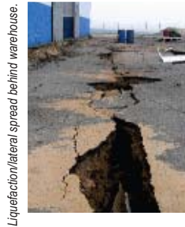
Liquefaction/lateral spread behind warehouse.

Other sections of the highway suffered from liquefaction/cracking, but probably remained passable immediately following the event. The only damaged bridge that was identified was on the Pan Am Highway crossing the Rio Pisco, just south of San Clemente.