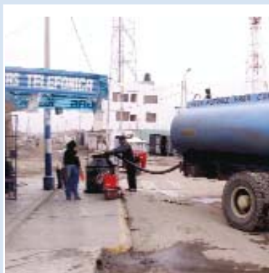
Emergency water distribution in Tambo de Mora.

Pisco gets water from a infiltration gallery 18 miles east of town. Pipeline damage along the transmission line into the town reduced the flow from 4700 GPM to 2700 GPM. The chlorine disinfection system at the operations center in Pisco was damaged from ground motion.